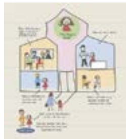
from info video by The SeaStar Centre, Halifax, NS